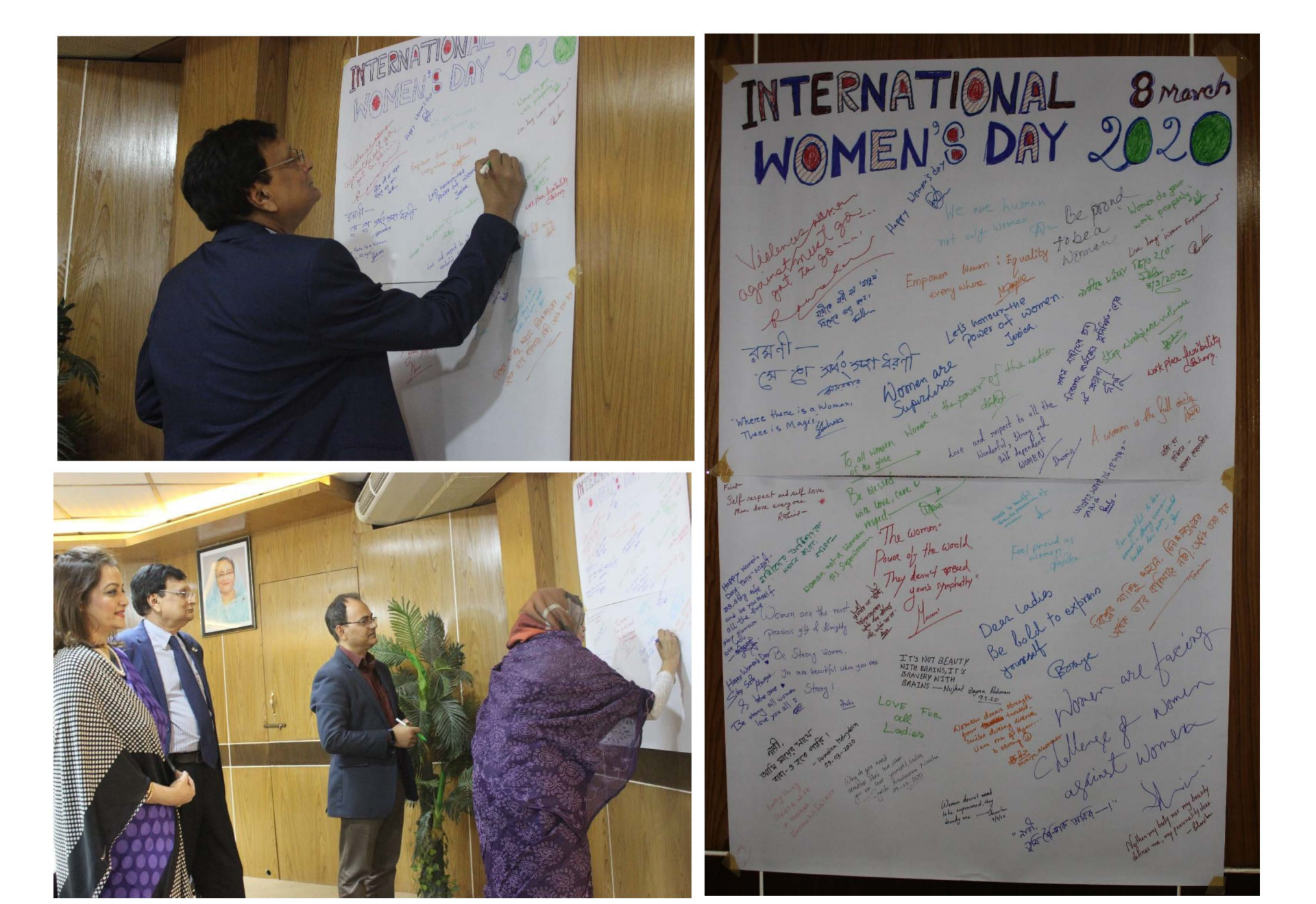
Thoughts on 'Generation Equality' during IWD celebration at BUHS on 8 March, 2020!