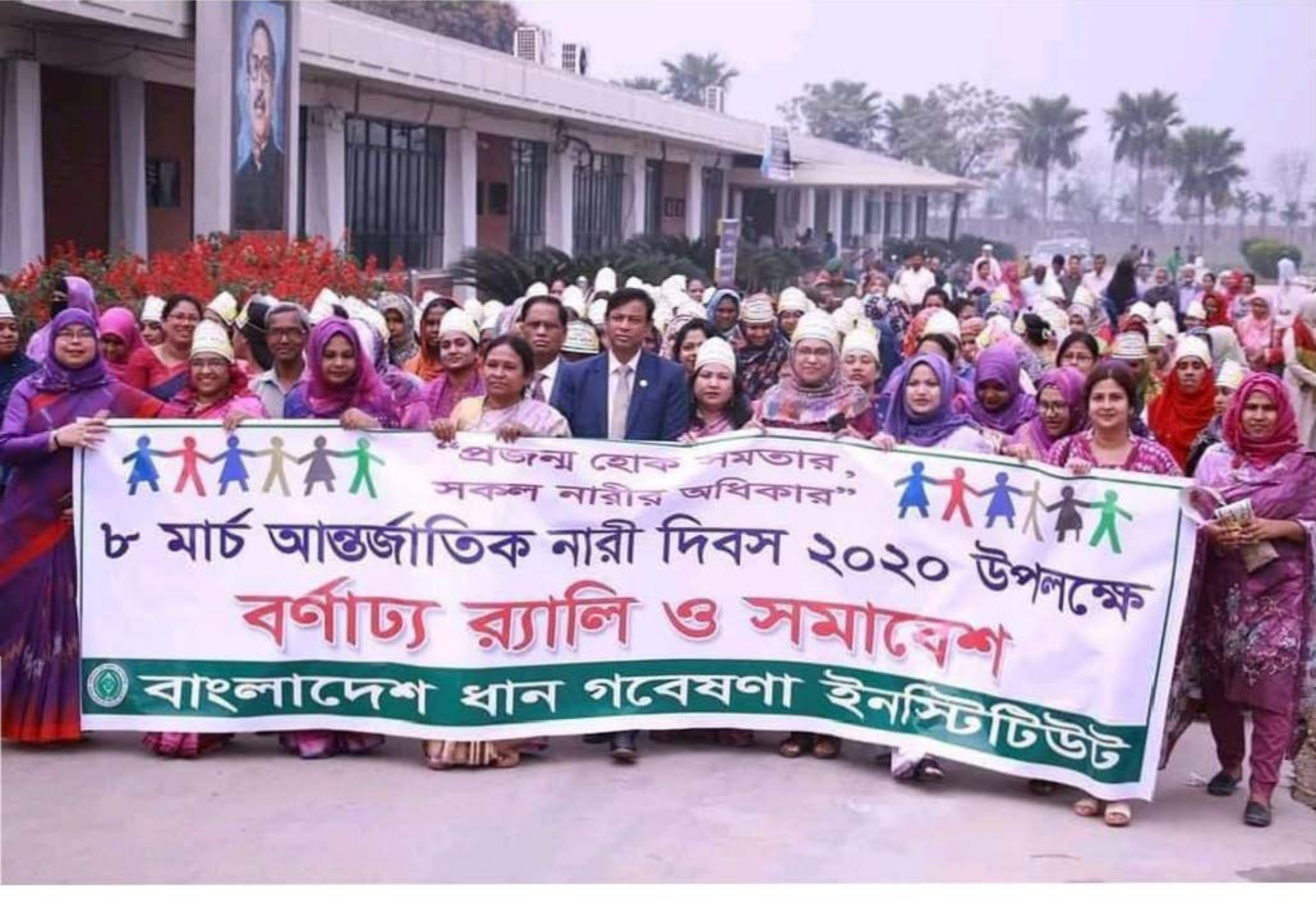
IWD celebration rally at BRRI on 8 March, 2020!