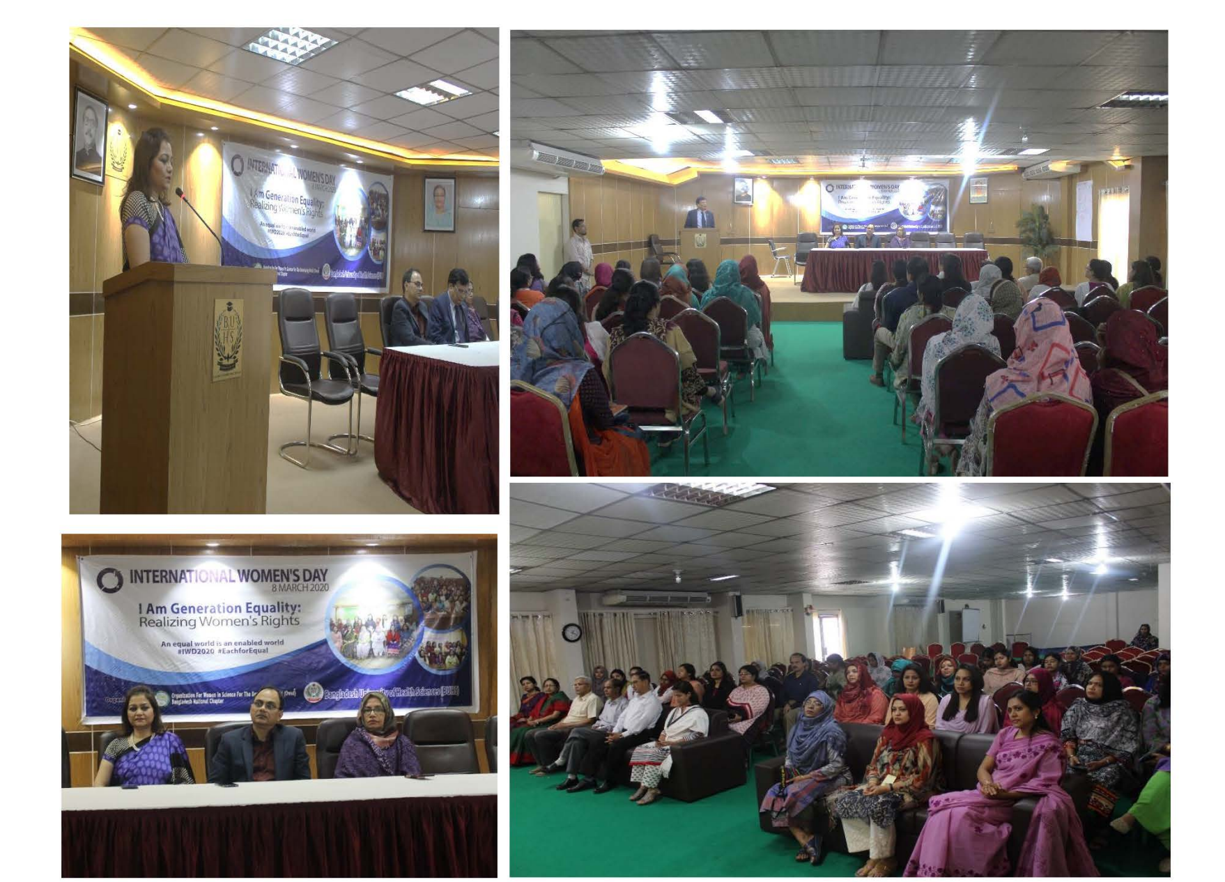
Seminar at BUHS on IWD celebration, 8 March, 2020!