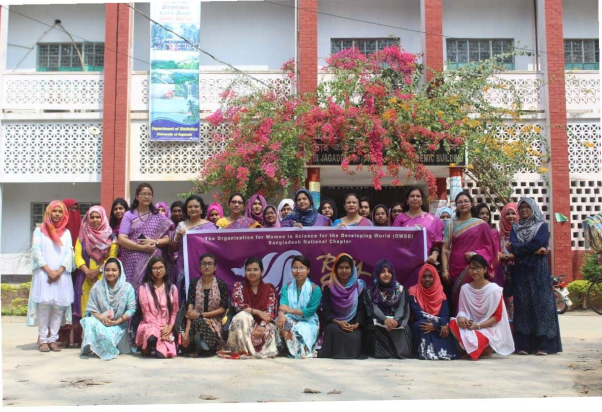
IWD celebration photos at Rajshahi University, Bangladesh on 8 March, 2020!