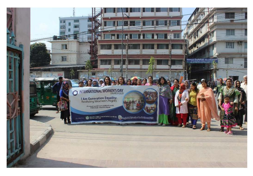
Rallies on IWD celebration at BUHS on 8 March, 2020!