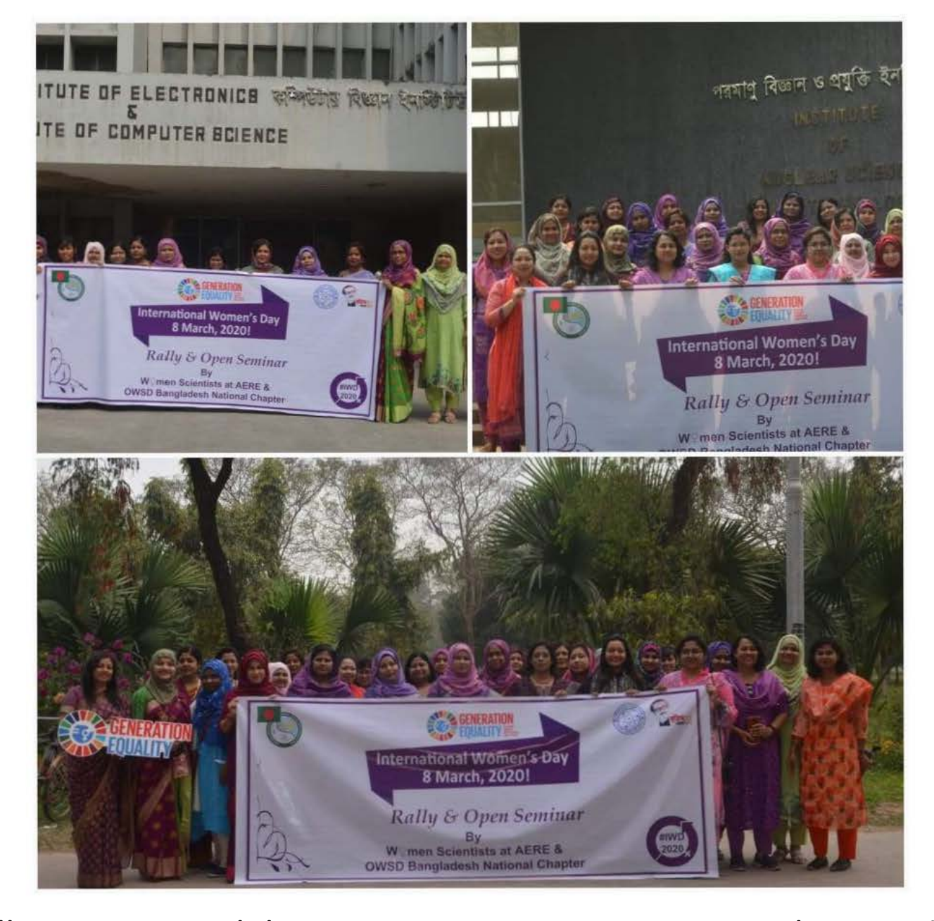
Rallies on IWD celebration at AERE, BAEC on 8 March, 2020!