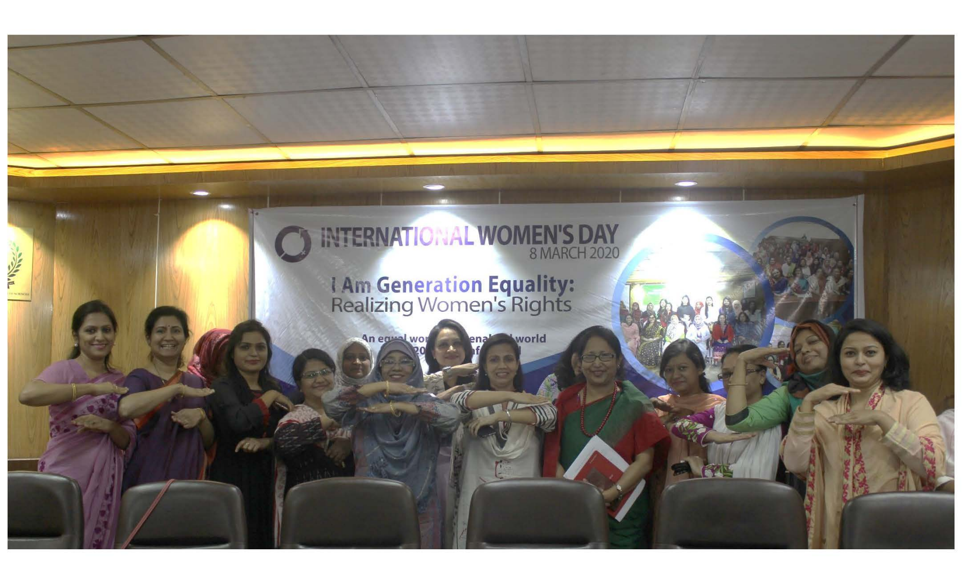
BUHS Professionals posing #EACHFOREQUAL on 8 March, 2020!