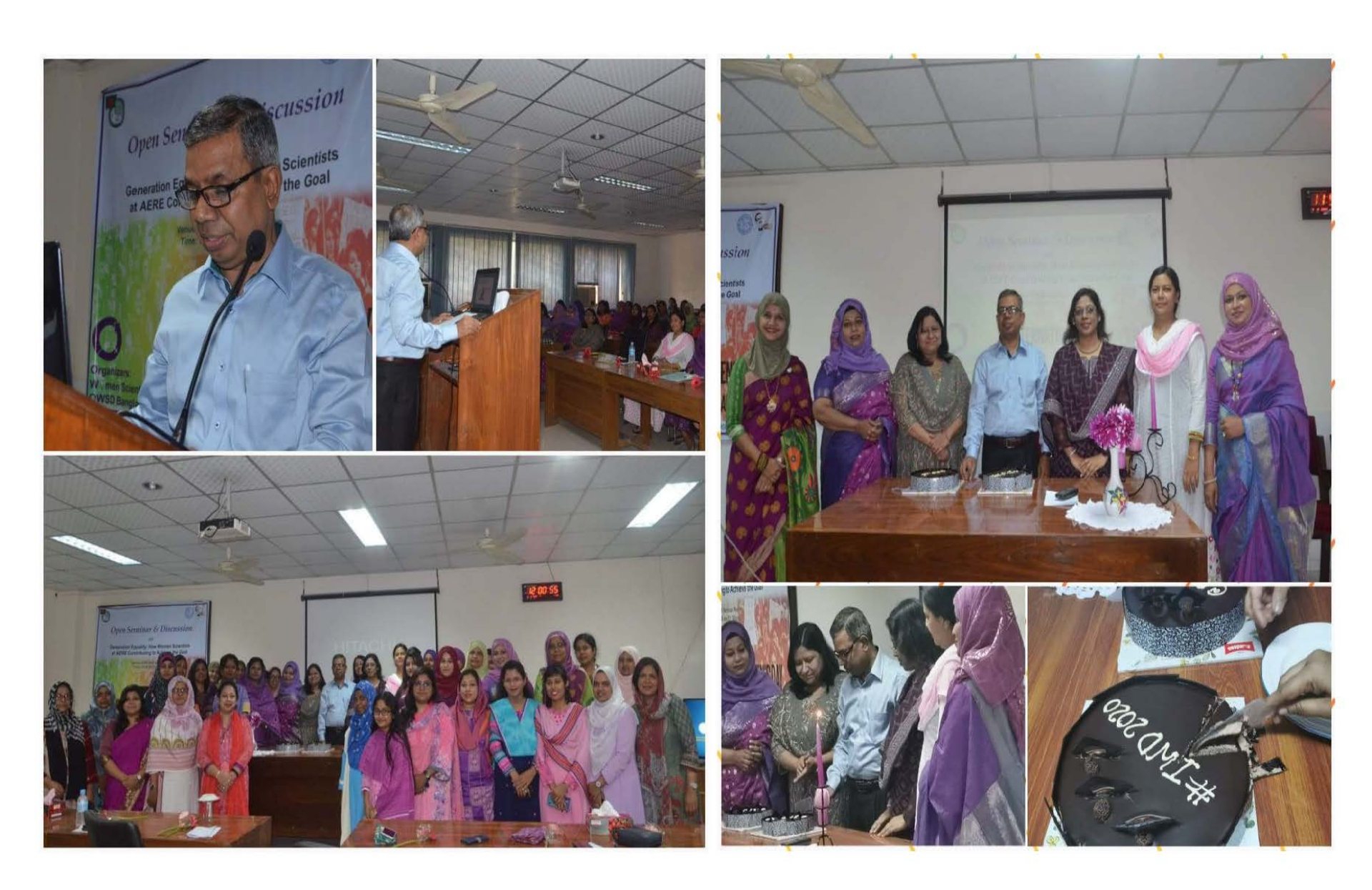
IWD celebration photos at AERE, BAEC on 8 March, 2020!